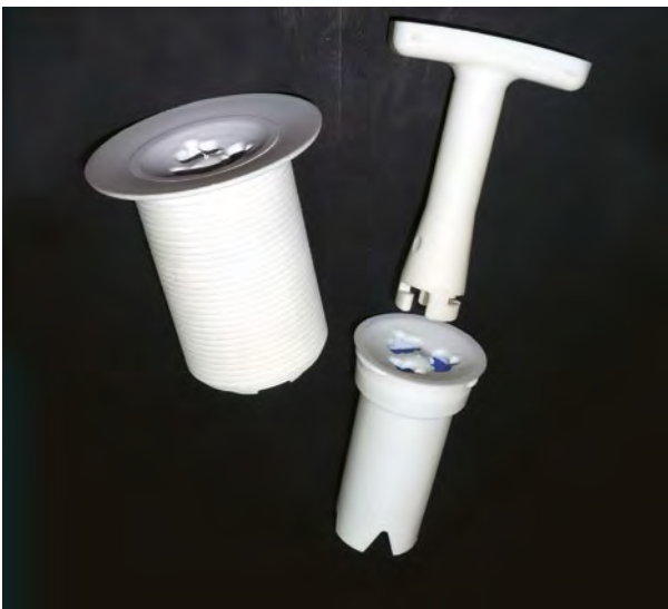
Figure 3. EcoSmellstop (ESS) unit with pipe fitting and extractor. Inside the ESS is the silicon curtain valve.