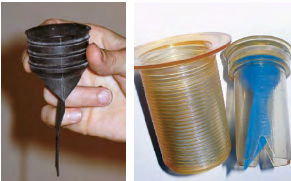
Figure 2. Two types of odour seals for waterless urinals. Left: Flat rubber tube (Keramag Centaurus). Right: (left side) See-through pipe fitting; (right side) see-through EcoSmellstop (ESS) unit showing the blue silicon curtain one-way valve inside.

The ESS manufacturing process is not simple as the injection moulds are of extreme complexity, and the mixing and injection requires very sophisticated machinery. For this reason, it is not yet possible to manufacture the ESS locally in developing countries, but it can easily be imported as it is small, light-weight and low-cost. This patented ESS unit is used by the companies Addicom, Kellerinvent AG and F. Ernst Ingenieur AG 15 since 2006.