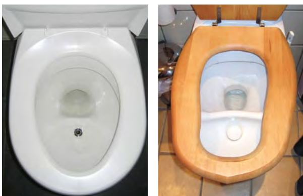
Figure 6. UD flush toilets. Left: Gustavsberg (in Meppel, the Netherlands); Right: Dubbletten (in Stockholm, Sweden); (sources: E. v. Münch, 2007).

UD flush toilets can also be combined with the concept of vacuum toilets (realised for example by the company Roediger for a pilot project in Berlin Stahnsdorf and by the Swedish company Wost Man Ecology, see Appendix ). This type of toilet collects urine and a small, concentrated amount of brownwater (faeces with about 1 L of flush water).