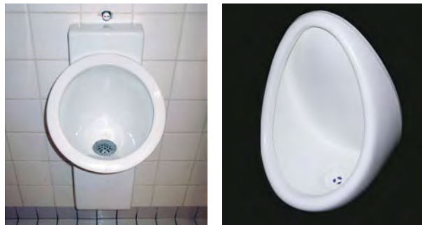
Figure 1. Waterless urinals for men. Left: Centaurus model of Keramag company. Right: Plastic urinal from Addicom, South Africa, with EcoSmell-stop device (sources: (left) E. v. Münch, Delft, 2006; right: Addicom).

Waterless urinals are the first and easiest step towards urine diversion and, possibly, ecological sanitation (ecosan).