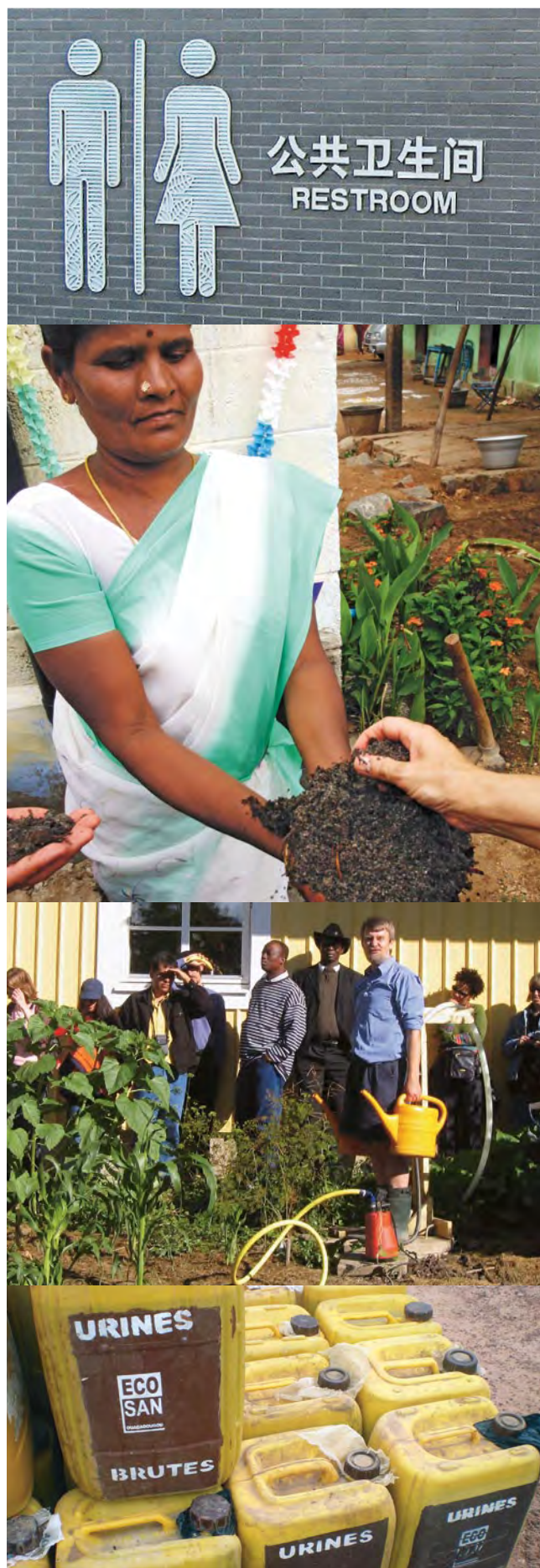
Figure 9. Plastic urine storage tank in Ouagadougou, Burkina Faso as part of the EU-funded project ECOSAN_UE led by CREPA..... 26

Figure 8. Urine storage tank made of a 150 m 3 plastic bladder at Lake Bornsjön near Stockholm, Sweden..... 26