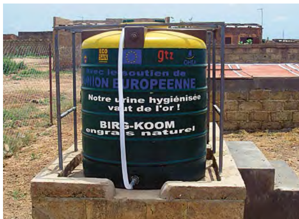
Figure 9. Plastic urine storage tank in Ouagadougou, Burkina Faso as part of the EU-funded project ECOSAN_UE led by CREPA.