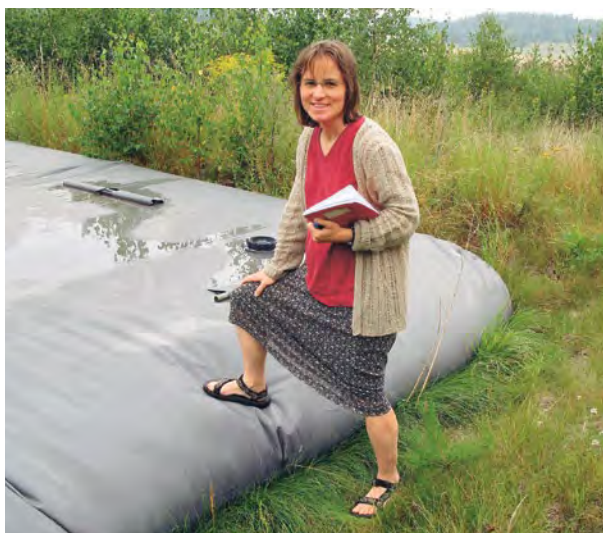
Figure 8. Urine storage tank made of a 150 m 3 plastic bladder at Lake Bornsjön near Stockholm, Sweden.