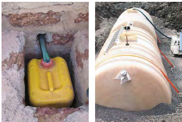
Figure 7. Left: Low-cost solution: 20 L plastic jerrycan for urine storage at individual toilet level in Ouagadougou, Burkina Faso. Note: it might be quite difficult to lift up a full jerrycan out of this enclosure. Right: Below-ground plastic urine storage tanks at Kullön, Sweden during the construction process. The tanks will be covered with soil.

Examples for urine storage tanks of different sizes are shown below.