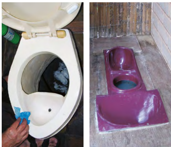
Figure 5. Left : Indoor UDDT (pedestal type) in Johannesburg, South Africa in the house of Richard Holden. Right : UDDT squatting pan in Bangalore, India, with three holes: the area in the front is for anal washing, middle is for faeces and back is for urine.

The anal washwater can be infiltrated in a gravel filter or treated together with greywater in a subsurface constructed wetland. UDDTs are especially popular wherever there is water scarcity and a demand for cheap fertiliser. They can be built indoors or outdoors.