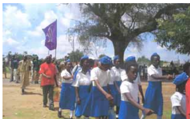
Mazabuka District World AIDS Day celebrations 2009

A key activity is to develop a strategy for the implementation of national Gender policy in local authorities. After a situation analysis was completed and recommendations for mainstreaming for improving Gender mainstreaming were made, a seminar " Gender in District Development Planning " was held for the focal councils and Provincial Administration. The workshop input documents were designed as reference documents for the council staff and an action plan was produced that outlined a methodology for creating Gender equality strategies for the focal districts. Steering committees were devised for this purpose and as a result, two districts, with technical advice from SDI, have completed " A District Strategy for Achieving Gender Equality ". Additionally, the District Gender Focal Point Persons (GFP) have had their positions formalised and their responsibilities enshrined in their job descriptions. Furthermore, the Provincial Administration plans to replicate this methodology to develop Gender equality strategies in the other districts in Southern Province.