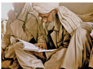
Chieftans are trained in legal texts

For more than 30 years now, the situation in Afghanistan has been one of armed conflict and ethnic tension. People's livelihoods have all but been destroyed. As one of the poorest countries in the world, Afghanistan is a priority country of German and international development cooperation. The international community has been supporting civil reconstruction since the fall of the Taliban regime in 2001. Germany has been accorded special responsibilities in the northern provinces of Kunduz, Takhar, Badakhshan, Baghlan and Balkh, an area in which the German armed forces are also engaged militarily as part of their ISAF mission (International Security Assistance Force).