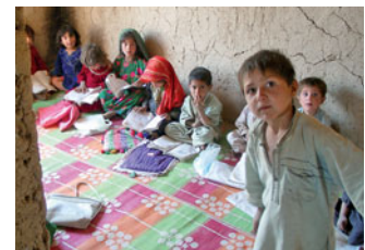
School in Kohi Safi