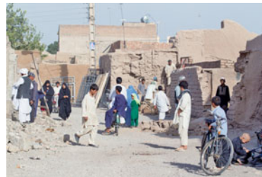
in Herat