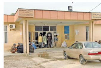
The Balkh Hospital is the main centre for health care in the region

GTZ also executes commissions for other German federal ministries. For example, working on behalf of the German Federal Foreign Office (AA), it is helping to build and equip police stations and training centres. Furthermore, GTZ is engaged in the training of hospital management staff, and for the German Federal Ministry of Defence (BMVg), it is managing the construction of military installations for the German armed forces in Kunduz and Taloqan.