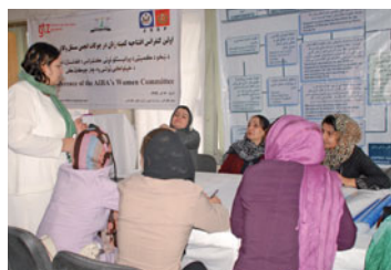
Training for female lawyers