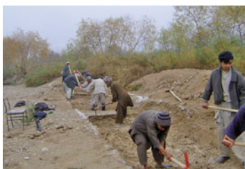
Construction of flood protection walls