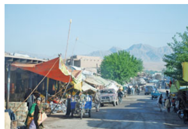
... and in Tarin Kowt