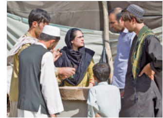
Meeting to plan for a biogas plant