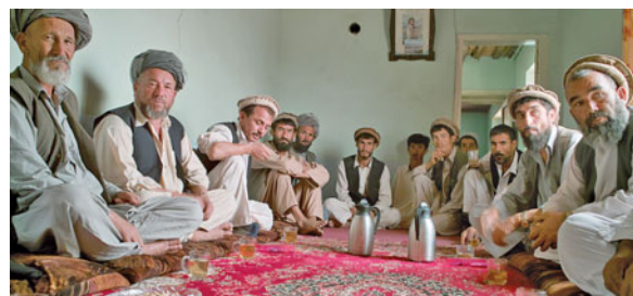
Council of elders gathering (Shura)

Networking instruments: Via district or province development funds, DETA also makes it possible for communities to submit applications for projects that they will implement themselves with GTZ support. This might involve the construction of a bridge, road, or school. Stabilising measures of this kind evolve into long-term projects – assistance that ultimately becomes self-sustaining.