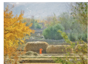
Agriculture in Khenjan