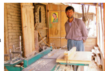
and increases the productivity of small businesses

GTZ's activities for international donors include, in the southern province of Uruzgan, a commission from the Dutch Government to implement a provincial development programme designed to promote the rural economy, train administrative staff and build key connecting roads. For the Global Fund to Fight HIV/AIDS, Tuberculosis and Malaria, GTZ is providing support for an HIV programme. The World Bank also calls on GTZ's expertise, amongst other things to promote school education for girls.