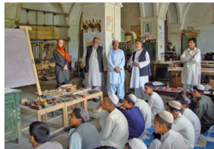
Vocational training