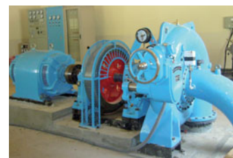
Electricity is generated by water power/ Badakhshan Province

GTZ's activities for international donors include, in the southern province of Uruzgan, a commission from the Dutch Government to implement a provincial development programme designed to promote the rural economy, train administrative staff and build key connecting roads. For the Global Fund to Fight HIV/AIDS, Tuberculosis and Malaria, GTZ is providing support for an HIV programme. The World Bank also calls on GTZ's expertise, amongst other things to promote school education for girls.