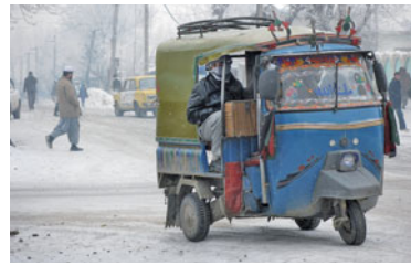
Street scenes in Kunduz