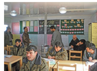
Literacy training for the police