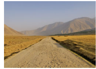
Cultivating under difficult conditions

Minimising risks: Together with the other German implementing organisations, GTZ has a comprehensive risk management system that reaches out across all projects like an umbrella to shield staff by ensuring they have the requisite scope for action and sufficient mobility. Culturally sensitive behaviour also plays a role with regard to security, since staff competence and credibility help reduce risks and elicit assurances of safety from the Afghan side that make it possible for development work to go ahead.