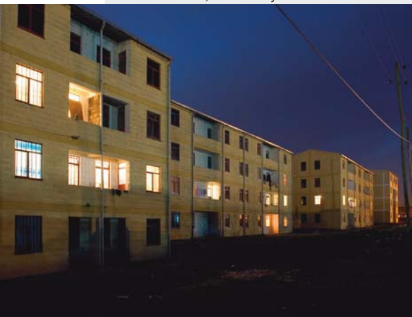
Addis Ababa, Bole/Gerji Settlement

The construction sector – motor of economic development – has boosted the economy, improving its competitiveness.