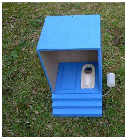
Figure 2: urine diverting toilet demonstration model

For hand washing a washbasin was rehabilitated and equipped with towels and soap.