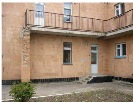
Figure 3: location for conjunction the new ecosan toilet facility with the school