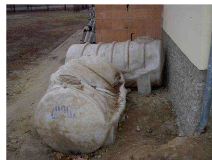
Figure 12 : Deformed urine tanks