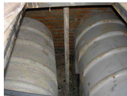
Figure 13: New tanks in a sub-surfaced chamber

The aforementioned smell problems could be improved by: