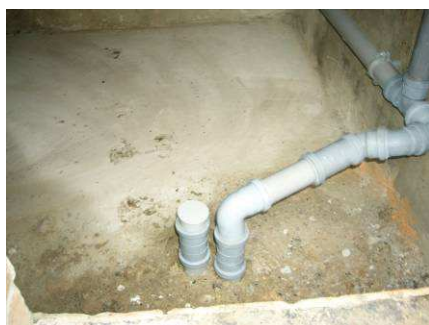
Figure 11: Piping system for changing the urine flow-in from the one to the other urine tank

The urine from the diverting-toilets and the waterless urinals is collected in a urine tank made of Poly Ethylene (PE), 5 mm. Two urine tanks of 2 m 3 each were bought. The two tanks, similar to the composting chambers, are necessary for the 6 months or longer resting time, during which most of the pathogens are killed or at least reduced.