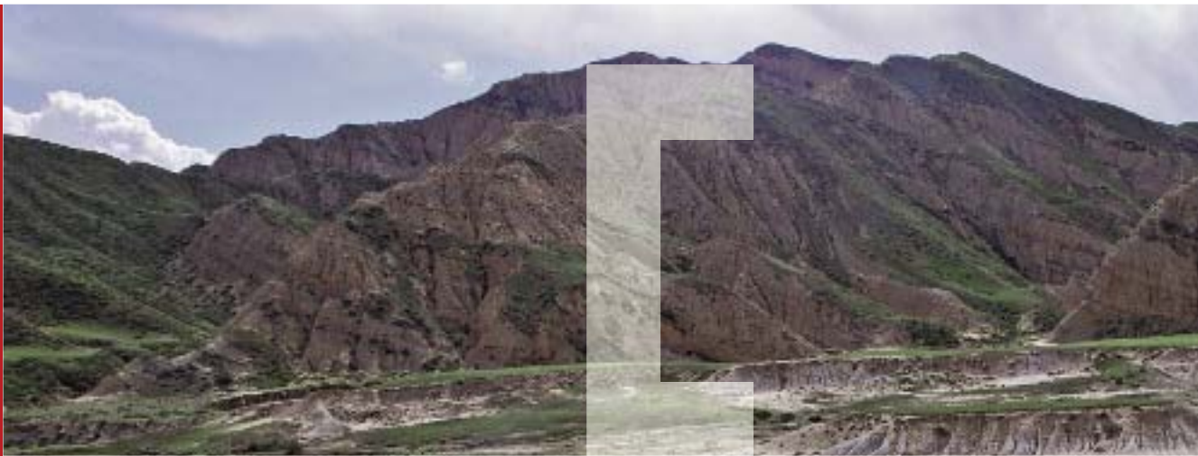
Soil erosion caused by overgrazing in Jergetal