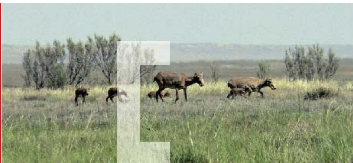
Saiga with their young in the Betpak Dala steppe in central Kazakhstan.