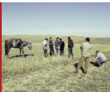
Project staff discuss an improved pasture management system with livestock farmers.

To promote the conservation and later sustainable use of the Saiga antelope and other endangered species, GTZ is working with the Association for the Conservation of Biodiversity in Kazakhstan (ACBK), which also receives support from the Frankfurt Zoological Society. The project addresses the coordinated management of protected areas and hunting grounds with the aim of introducing comprehensive control and management of these areas. For the first time in Kazakhstan, managers and staff of protected areas and hunting grounds are being trained together in the conservation and sustainable use of wildlife. This began at the end of 2009 with the first phase of the planned three-year project.