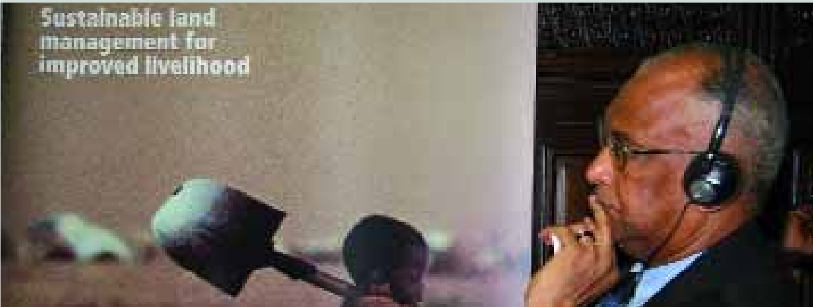
Zeini Moulaye (Former Minister of Mali)

Sustainable land management for improved livelihood