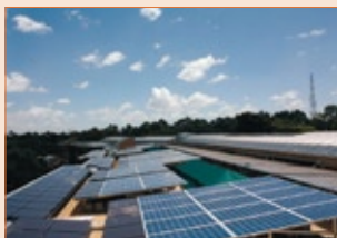
Nairobi, Kenya German solar firms together with local partners realised sub-Saharan Africa's largest solar PV plant at UNEP's headquarters.

To further spur these promising trends, PDP organises multiday technology forums that bring together relevant public and private stakeholders. Workshops on technical issues, business models and financing options are complemented by business-to-business meetings. Project opportunities are presented during site visits. PDP technology forums set the stage for making contacts, exchanging information, and identifying projects – with the aim to accelerate solar and biogas market development in East Africa.