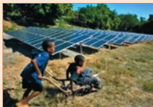
Mombasa, Kenya Pioneering grid-connected solar in East Africa: the SOS Children's Village in Mombasa goes green with German solar PV technology.

Kenya and Uganda offer two of the most progressive and investor-friendly frameworks in the East African region and may become role models for private sector participation in grid-connected renewable energy power generation. In Kenya, two of the largest solar plants of sub-Saharan Africa have been installed by German companies and local partners in 2010 /2011.