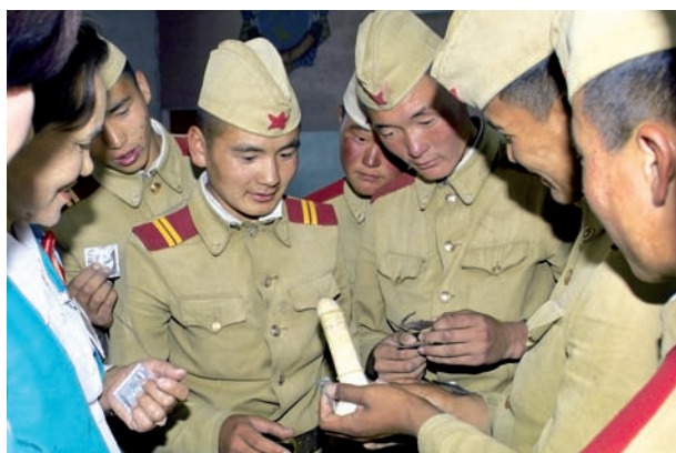
Condom Demonstration in the Mongolian Army

In the Russian Federation the JIC is implemented as Marshrut Besopasnosti (Safe Path) in 6 regions and regularly monitored by the Evaluation Institute of the Ministry of Education.