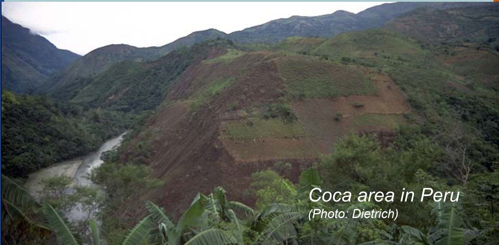
Coca area in Peru